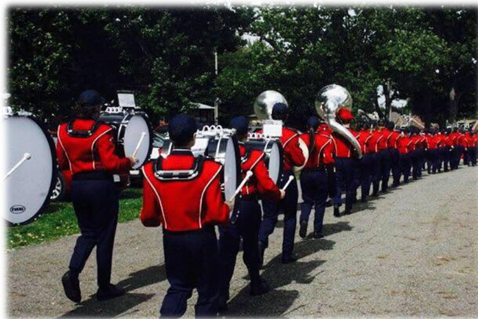
The Malone University Pioneer Spirit Marching Band descending the hill into Tom Benson Hall of Fame Stadium (formerly Fawcett Stadium) during the 2014 football season.